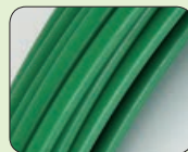
Speedy Steel Nylon-steel probe Ø 6 mm